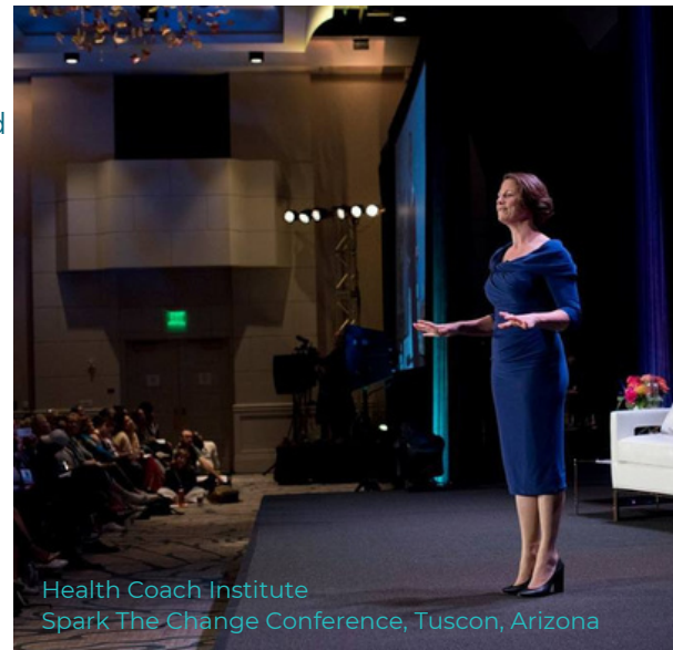
Health Coach Institute Spark The Change Conference, Tuscon, Arizona

Click HERE & HERE for headshots & HERE for logo