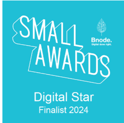
Digital Star 2024 Finalist for The Small Awards UK