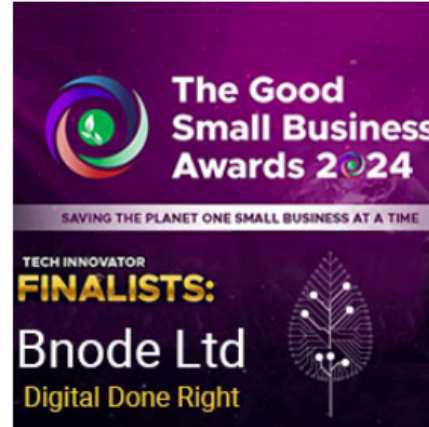
Tech Innovator 2024 Finalists for The Good Small Business Awards