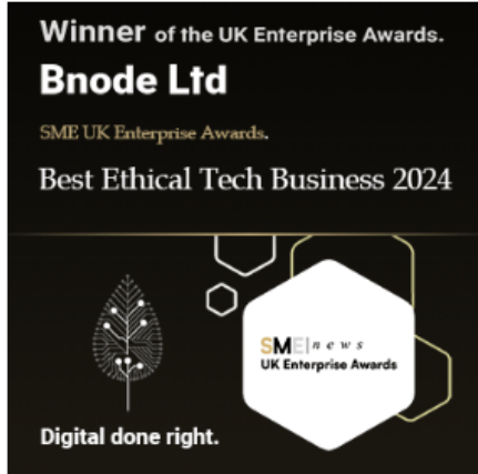
Best Ethical Tech Business 2024 – UK Enterprise Awards

Bnode are proud to have achieved the following awards and nominations for our ethical business practices and innovations: