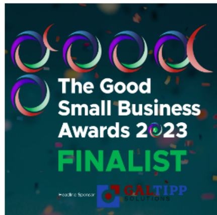
The Good Small Business Awards Finalists 2023